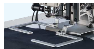
LK-1920 (Separately driven feeding frame <pneumatic>)

*The monolithic type (electromagnet-driven) is provided with the manual pedal that allows the feeding frame to be lifted/lowered according to how the pedal is depressed.